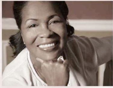
Programs & Events Guide