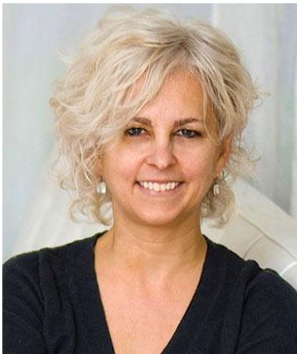
Kate DiCamillo